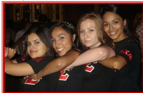
AX Founding Line Pictured above.